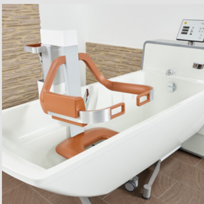
Fits easily in any modern care bathtub