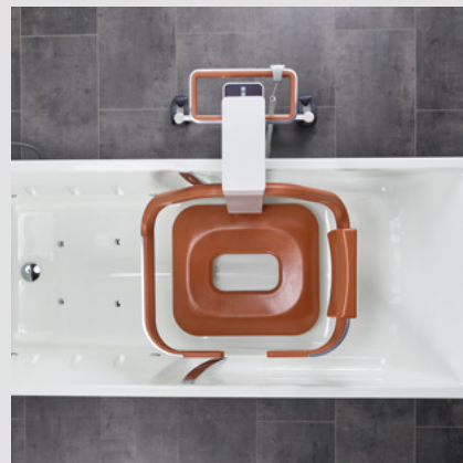
Comfort seat with care opening