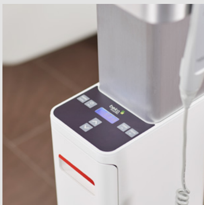
Optional: integrated patient scale