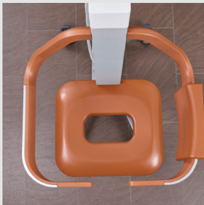
Ergonomic safety handles enable precise maneuvering