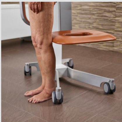
Low entry height of 49.5 cm enables easy self-entry