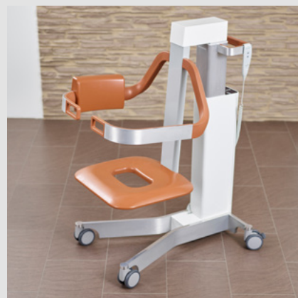
High quality aluminum and stainless steel construction