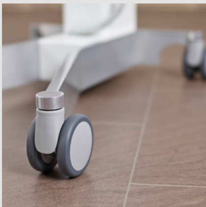
Easily mobile double castors, two of them with brakes