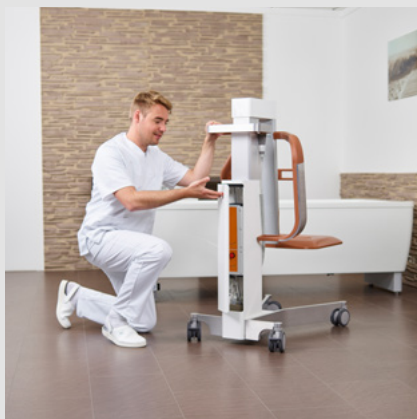
Battery and emergency stop function